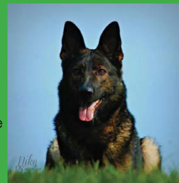
Nike von Sitz vd Hose, IPO 3, KKL1